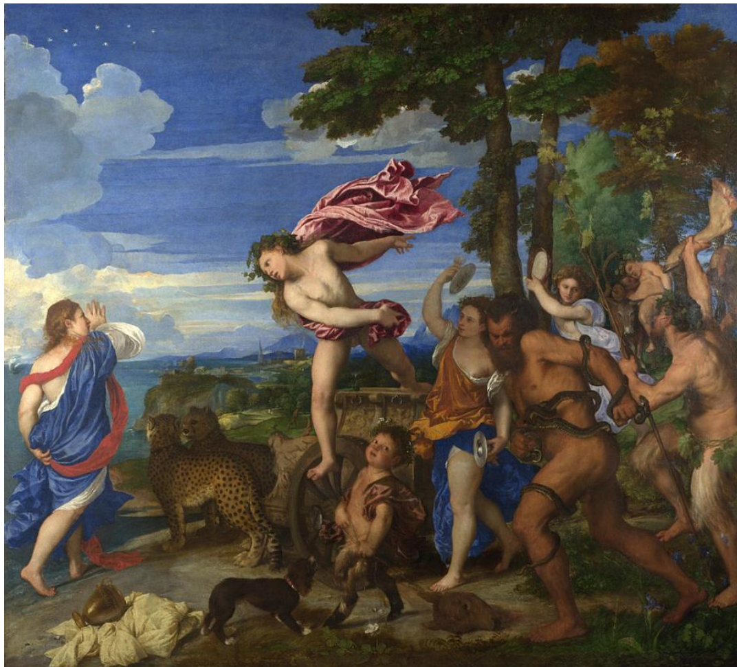
Вакх и Ариадна, Тициан (1520-1523)