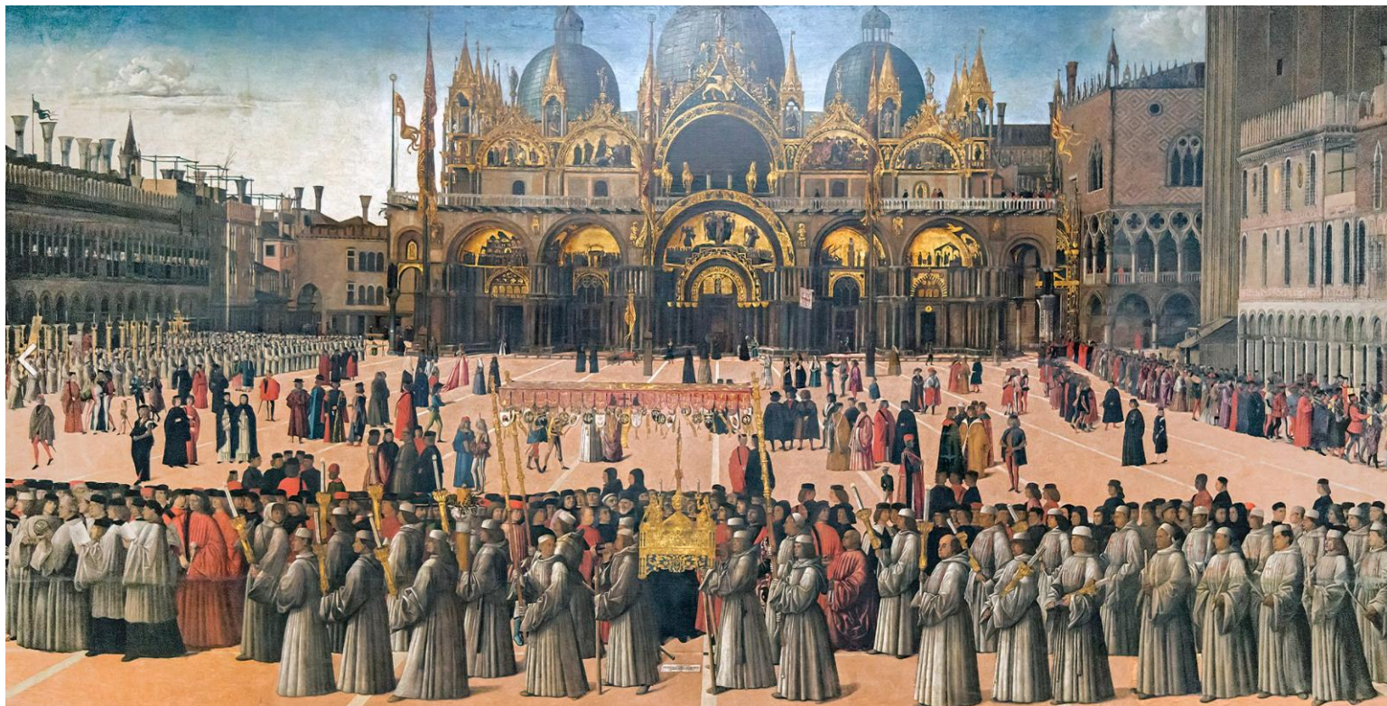
Венеция, 13-14 вв.