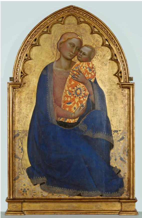
Jacopo di Cione. Madonna dell'Umiltà, 1365-1370

22_Jacopo di Cione_ Madonna dell'Umiltà, 1365-1370 - Dipinto su tavola cm 105x66.5 Galleria dell'Accademia, Firenze.jpg (2710x4176) (wikimedia.org)